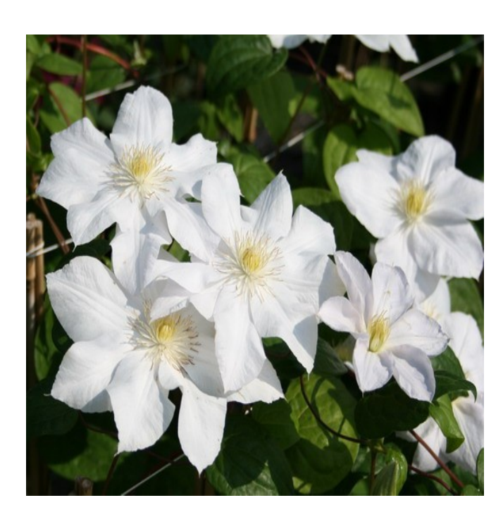
"Mme Le Coultre"