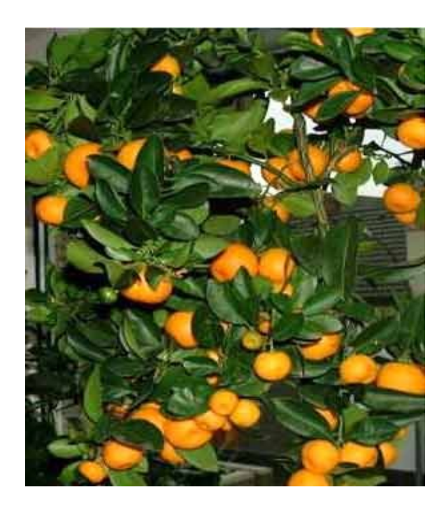
mitis (C. madurensis), Calamondin

Origin: China. Some botanists maintain it is a cross between the mandarin and the kumquat. Compact, fairly vigorous plant, with small leaves. Flowers and fruits almost all year round. Heavily scented flowers; very abundant, small, round fruits are have a thin, sweet skin and sour flesh with few pips. It is the most resistant of all Citrus, to the heat of the apartments, it is therefore a very popular Christmas houseplant.