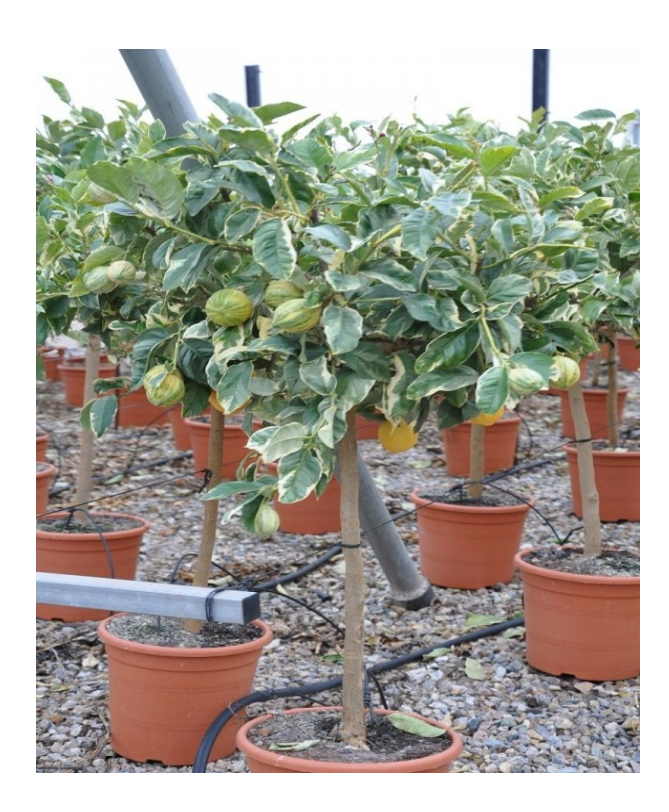
limon "Foliis Variegatis", Variegated Lemon

Medium-sized, round, juicy fruits. Big leaves with a lot of creamy-white variegation.